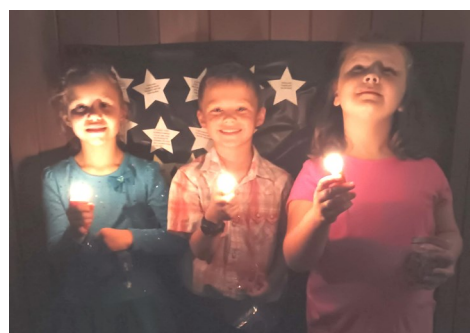
Here to shine the light of Jesus

All Stars BREAKS for Memorial Weekend, May 26.....AND June 2nd