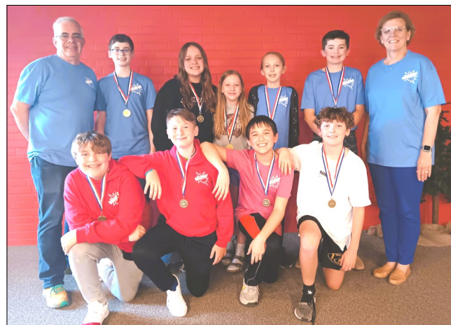
What an honor to serve with young people who are growing in faith & desire to serve.